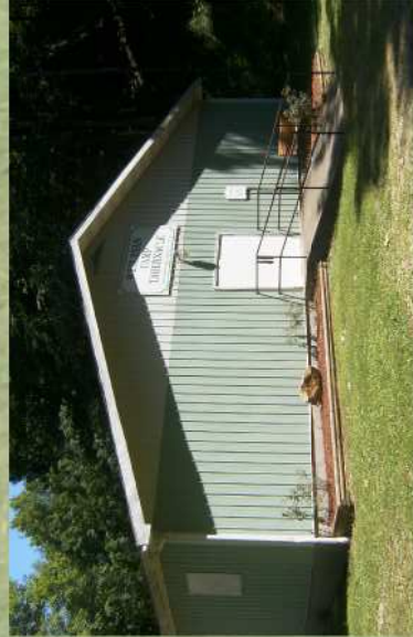
Above is the Wesleyan Fellowship Tabernacle. This tabernacle hosts two camp meetings, the Wesleyan Youth Camp and the Holiness Fellowship Camp Meeting.